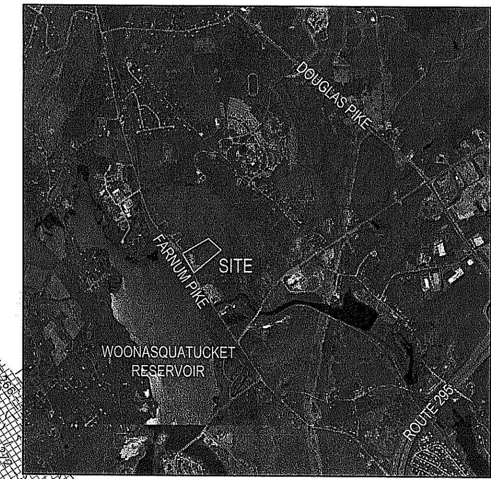
AERIAL IMAGE NOT TO SCALE

TOTAL WETLAND DELINEATION TO BE VERIFIED = 3,112 LF. A46-A53 = 300 LF. D3-D5 = 125 LF. E4-E33 = 962 LF. F4-F14 = 288 LF. G1-G12 = 300 LF. H1-H9 = 543 LF. J3-J24 = 510 LF. K1-K5 = 84 LF. TOTAL = 3,112 LF. NOTE C9-C19 = 405 LF. (OFF SITE)