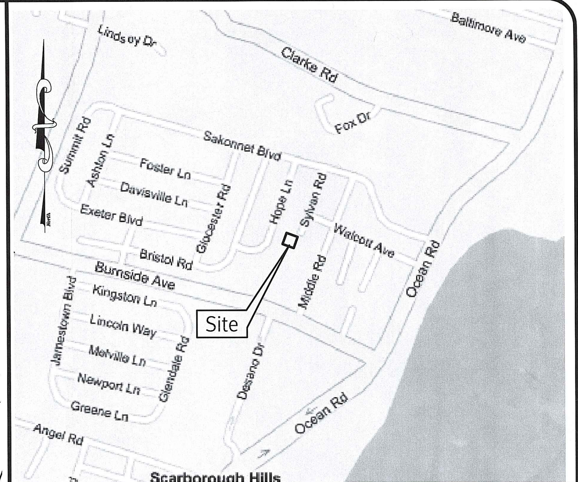
Location Map Scale: 1"=500'