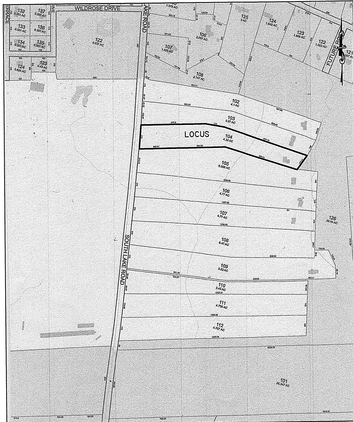
LOCUS AS SHOWN ON ASSESSOR'S MAP