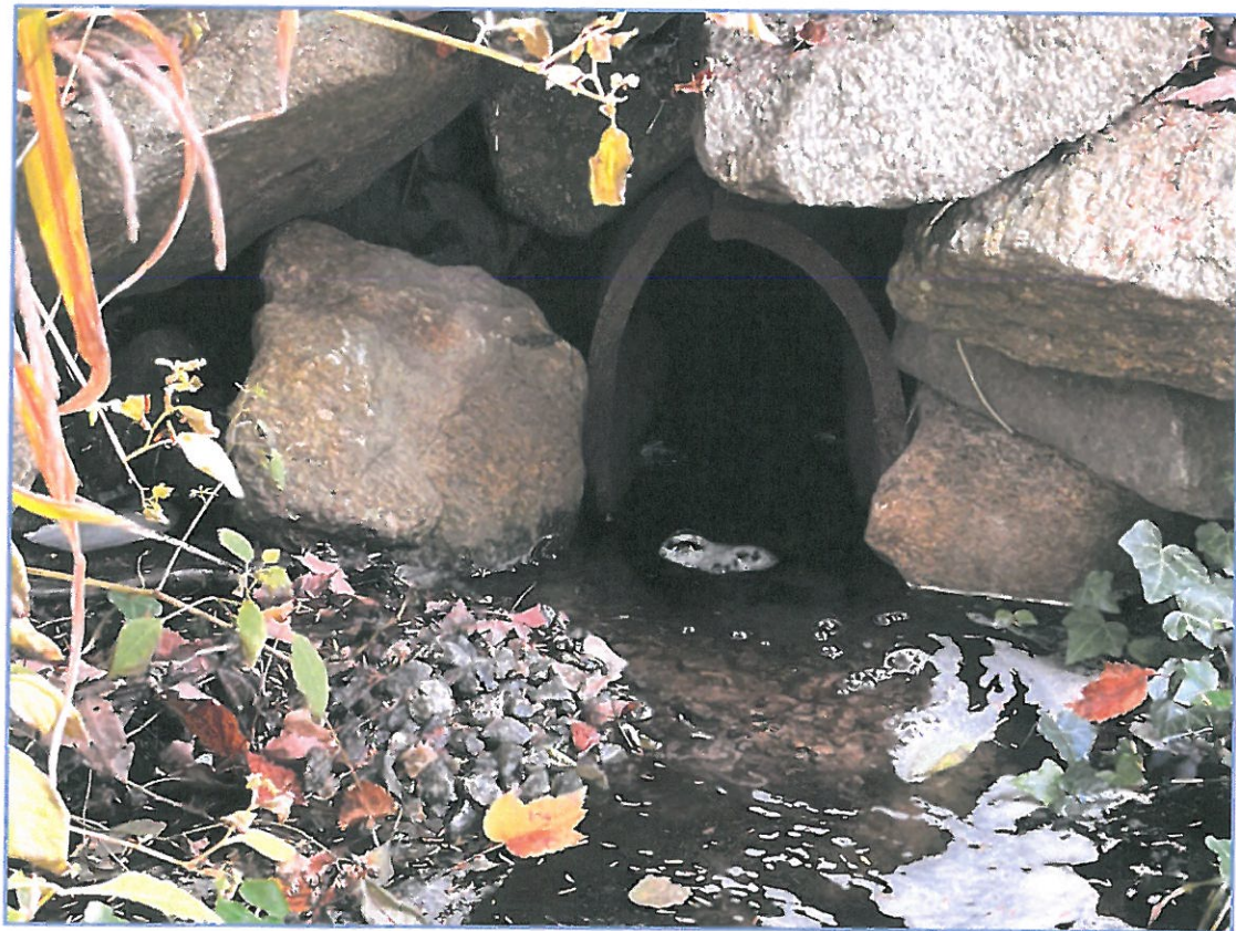
Collapsed clay culvert pipe under Hemlock Drive

RI Environmental Council OCT 27 2023 City of Bristol