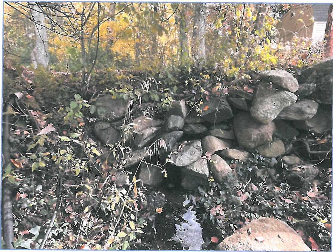
Field stone headwall along Hemlock Drive