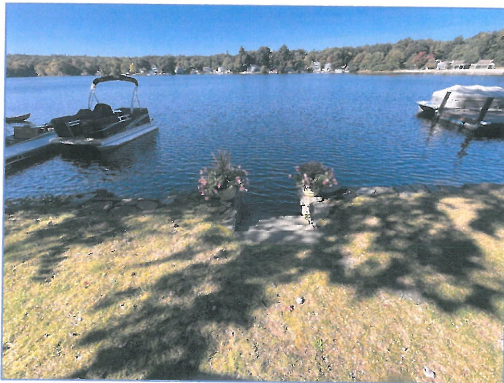
View of wall from lot interior